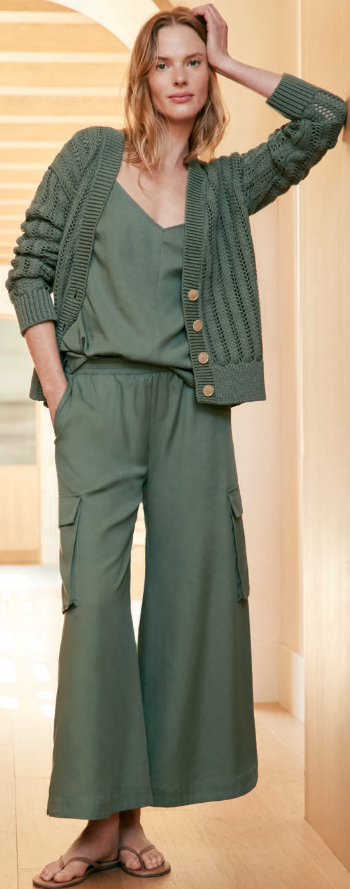
A Drapey Twill Double V-Neck Cami in Pine, A02457 $48 B Open Stitch Cardigan in Pine, B02457 $148 C Drapey Twill Cargo Culottes in Pine, C02457 $98 D TKEES Lily Sandals in Beach Bum, D02457 $55